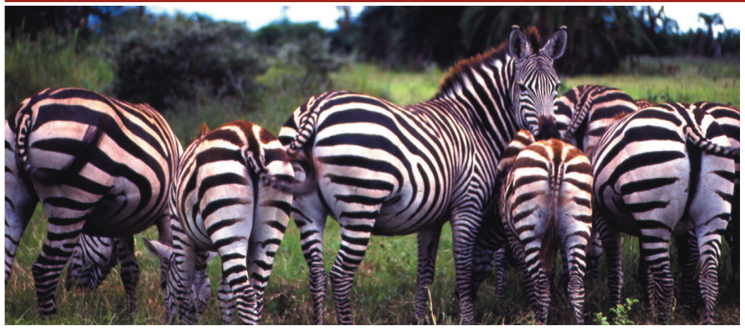
WARRIORS | ZEBRAS